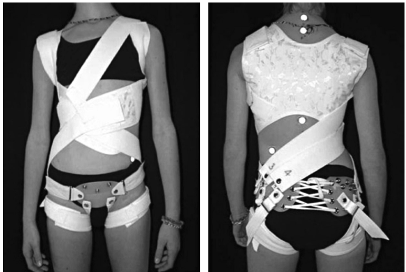
FIGURE 2. Front and back views of the SpineCor brace fitted for the right thoracic type 1 curve: the brace keeps and stimulates the specific corrective movement for the right thoracic curve.

Improvement of more than 5 degrees or stabilization of \pm 5 degrees of the scoliosis curvature was defined as a positive outcome. An aggravation of the spinal curvature of more than 5 degrees, progression exceeding 45 degrees, withdrawal, and surgery were defined as negative outcomes. The data collected were analyzed in 4 outcomes, as suggested by the SRS Committee on Bracing and Nonoperative Management. 9 To strengthen the ability to compare and combine results